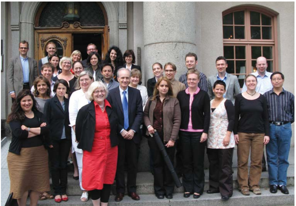
FLARE Summer School 2008

A second round of funding and a new programme of summer schools will be launched in 2010 and the team have already received a number of expressions of interest.